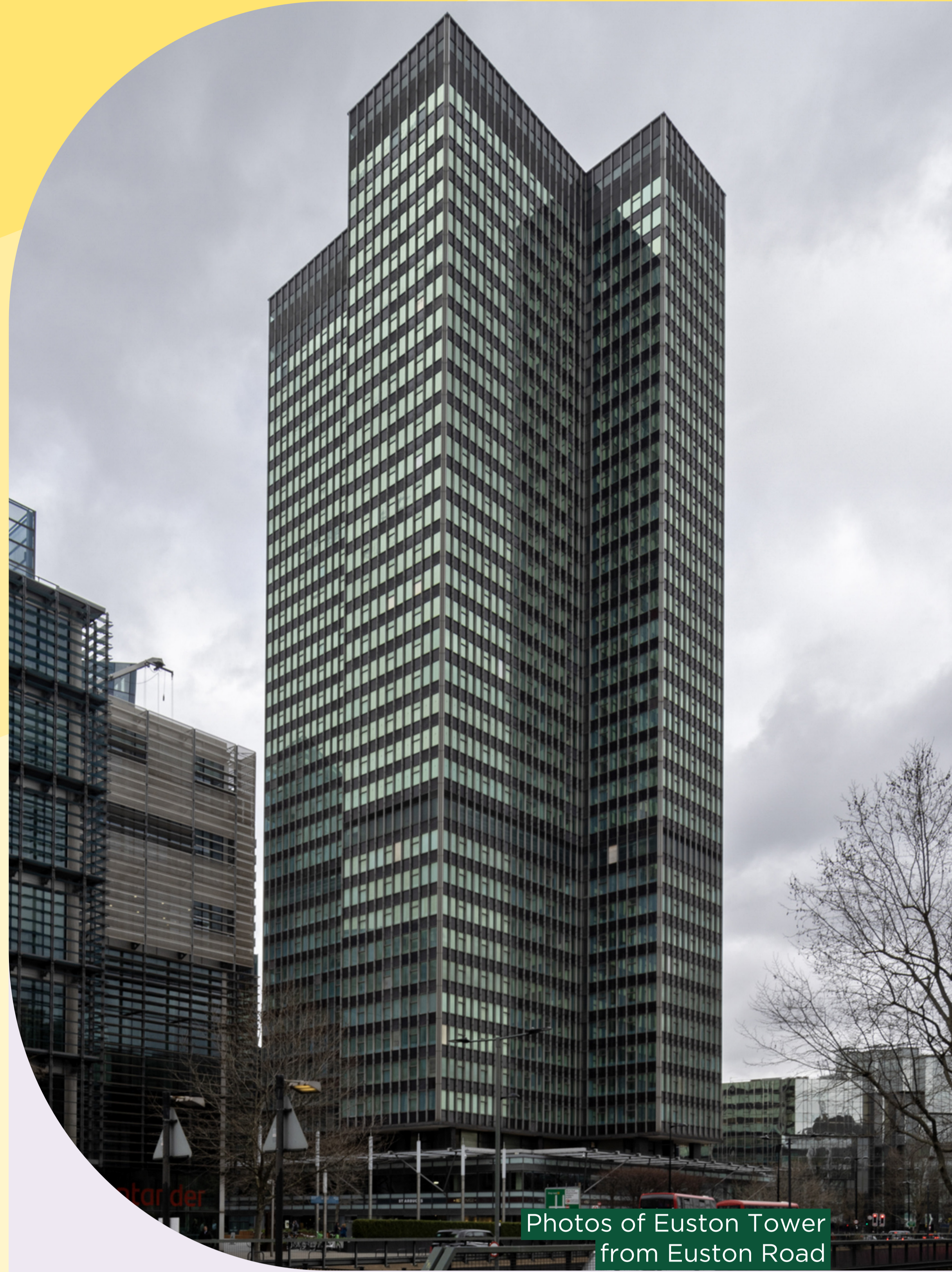
Photos of Euston Tower from Euston Road